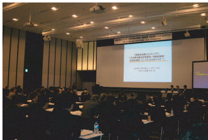
JGOG general assembly held every year

The JGOG is a nationwide organization established in 2002 with the aim of developing effective chemotherapy of gynecological cancer through studies jointly implemented by a multicenter trial network. The business activities of the JGOG can be roughly classified into clinical trials, international cooperation education, public relations and publications. The primary role of this organization is to conduct clinical research, including phase III studies using approved medicines. It also conducts phase I and phase II studies, meeting high quality requirements, and already has attained some achievements highly rated by the ASCO. In addition, this organization has begun to conduct joint studies with the Gynecologic Oncology Group (GOG) and Gynecologic Cancer Intergroup (GCIG), while actively engaging in the development of young researchers, who will become the driving force of future gynecologic oncology in Japan, by providing overseas dispatch programs and educational seminars for them. These programs have already started to bear fruit. The JGOG is one of the top research organizations specializing in the development of chemotherapy of gynecological cancer.