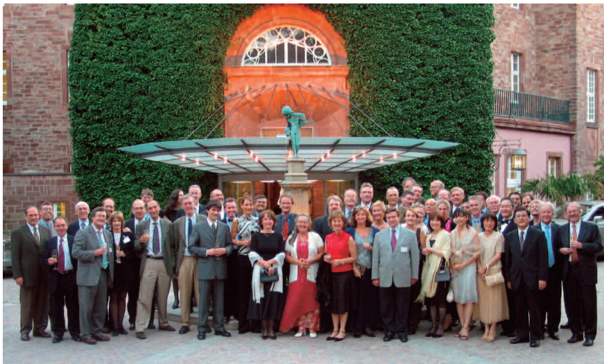
GCIG Ovarian Cancer Consensus conference September, 2004 Baden-Baden, Germany